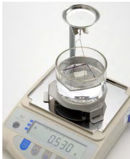
The need to determine density is found in many industries and the assembled density kit makes it easy to accomplish.

ifying the process even more. In fact the more sophisticated balances have a density program to lead users through the process.