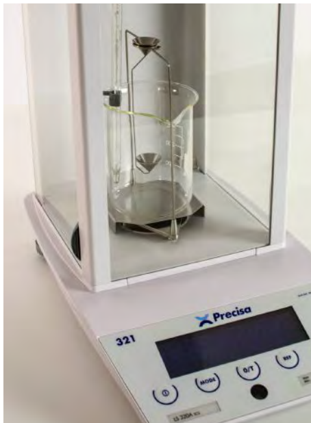
The density of an item can be found by using the Archimedes Principle of weighing the item in air and then in a liquid.

you need to do is know which balances have under-weighing capability or, in the case of analytical balances, which ones can have the density kit fitted. The more sophisticated balances have a density program included, so your end user can easily input the data he needs to get an accurate and consistent result. Many low capacity balances, such as analyticals, have density kits that can be purchased, simpli-