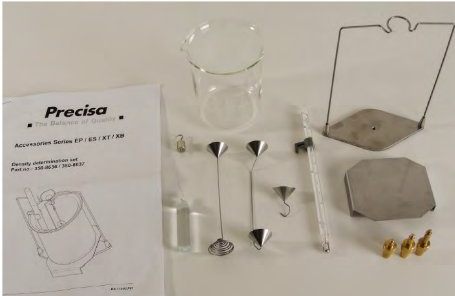
Density Determination Accessory Kits are available for various types of material. Some kits include density programs.

you need to do is know which balances have under-weighing capability or, in the case of analytical balances, which ones can have the density kit fitted. The more sophisticated balances have a density program included, so your end user can easily input the data he needs to get an accurate and consistent result. Many low capacity balances, such as analyticals, have density kits that can be purchased, simpli-